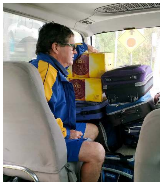
Spud protecting the beer while on the road