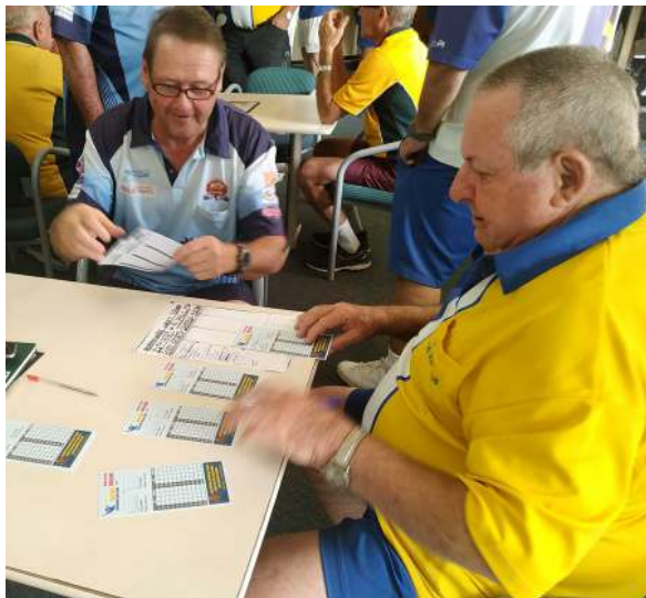
Doog doing the cards for the matches