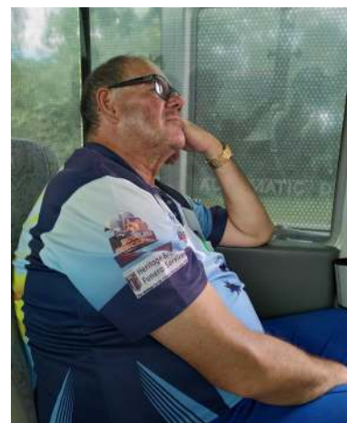
Grumpy relaxing before the big game